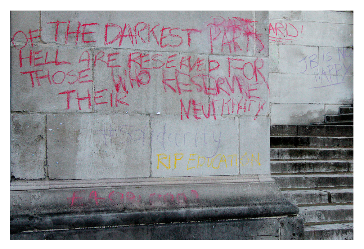
Image: Graffiti at University College London during the 2010 anti-austerity protests